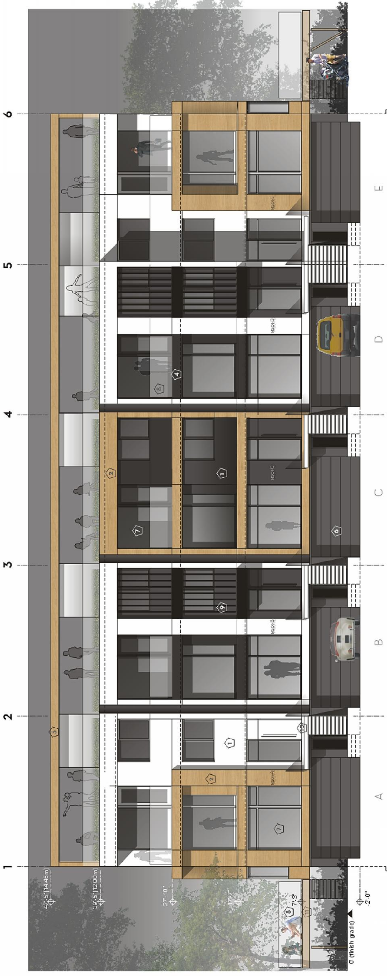
GROVENOR 5-PLEX :: EAST (FRONT) ELEVATION