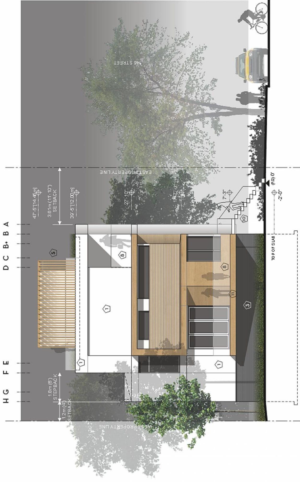
GROVENOR 5-PLEX :: NORTH ELEVATION