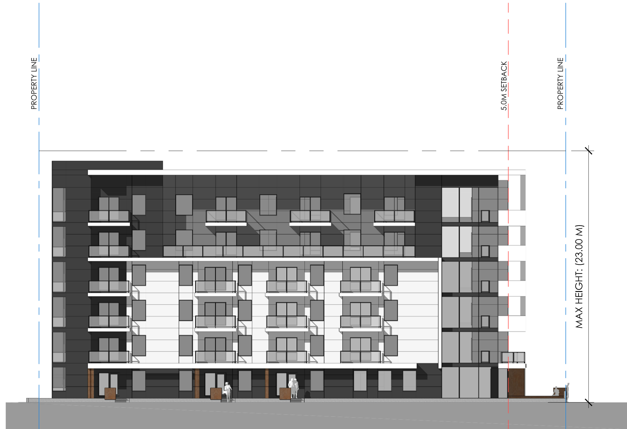
APPENDIX 3 - SOUTH ELEVATION