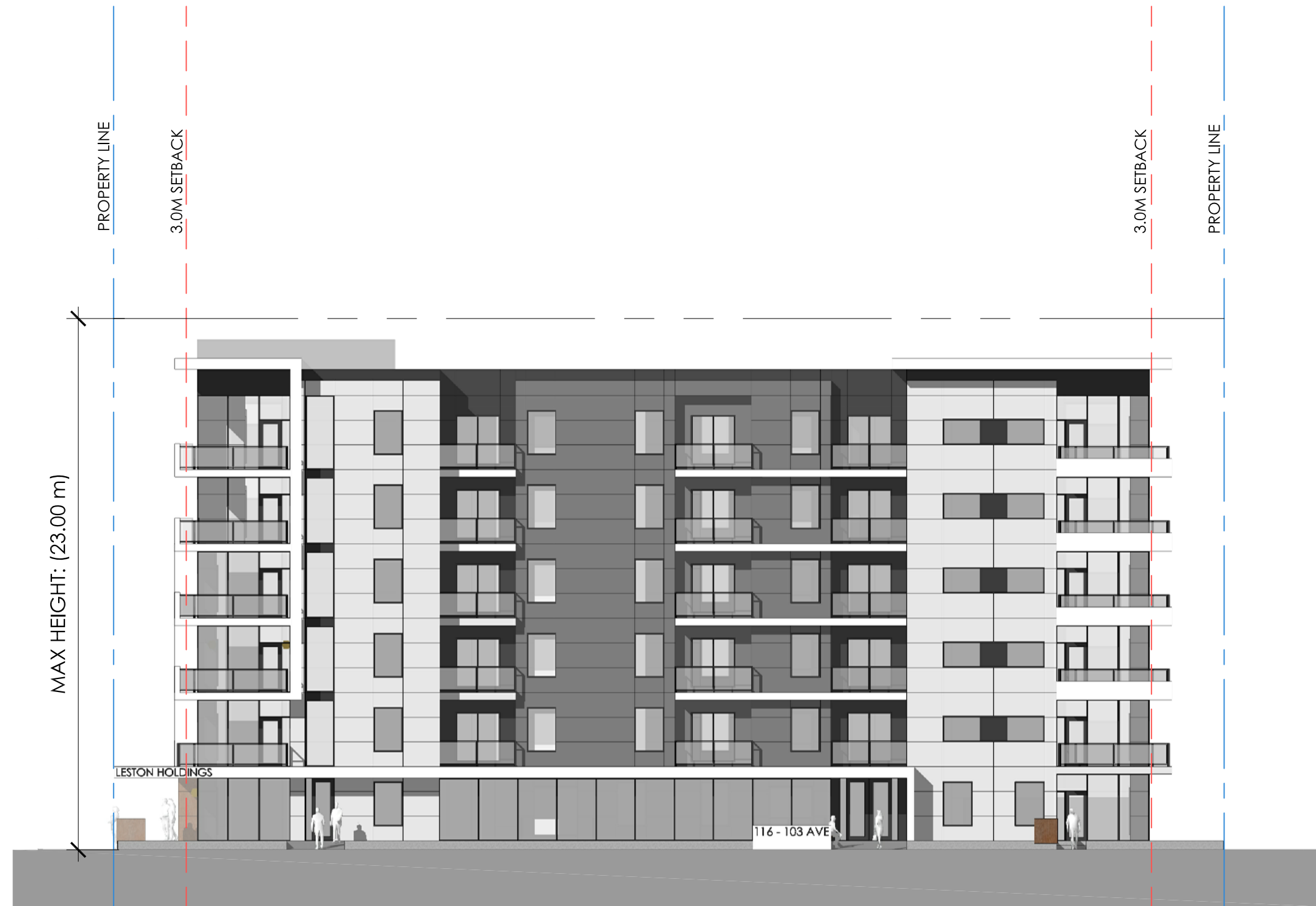
APPENDIX 4 - EAST ELEVATION