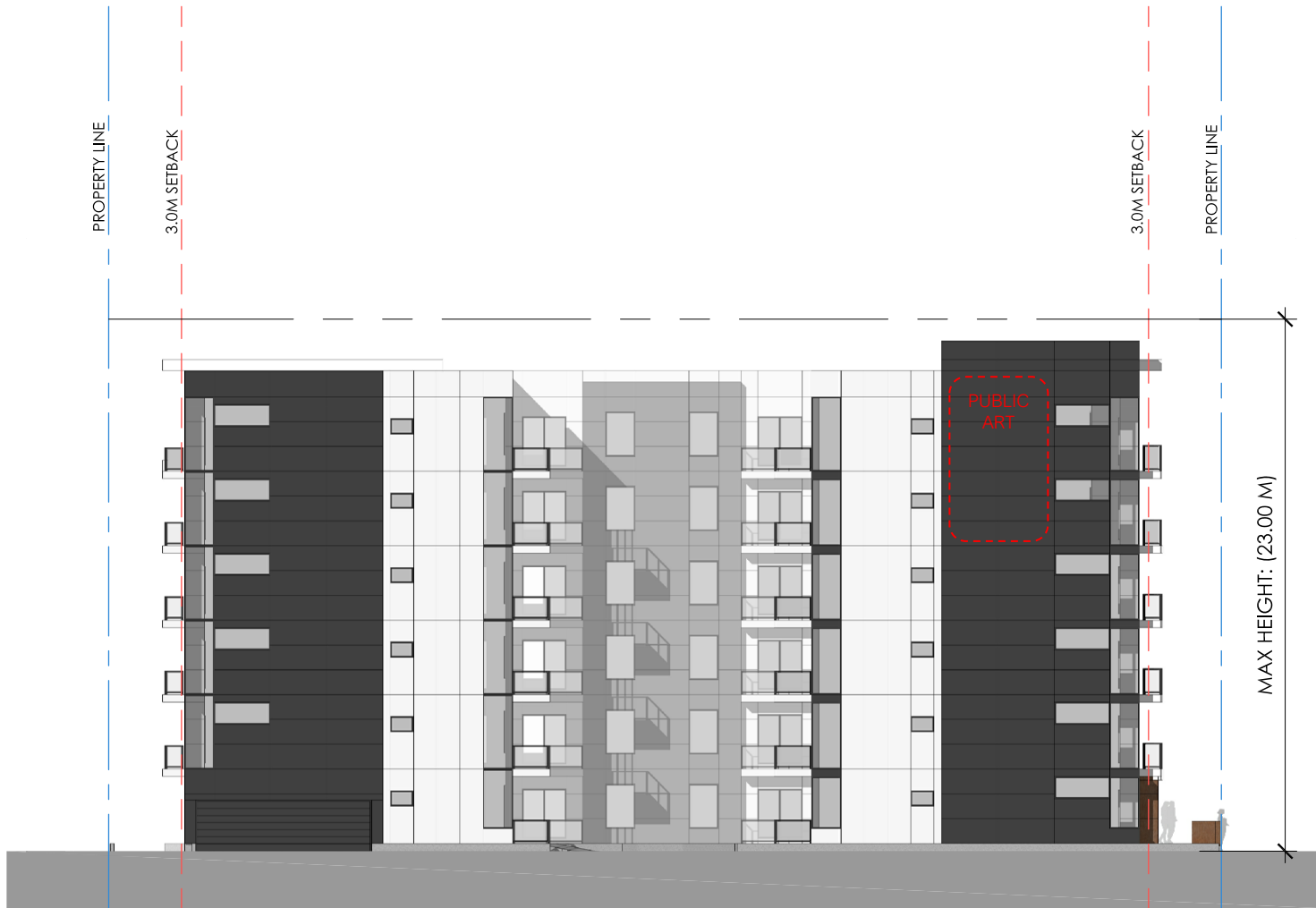
APPENDIX 5 - WEST ELEVATION