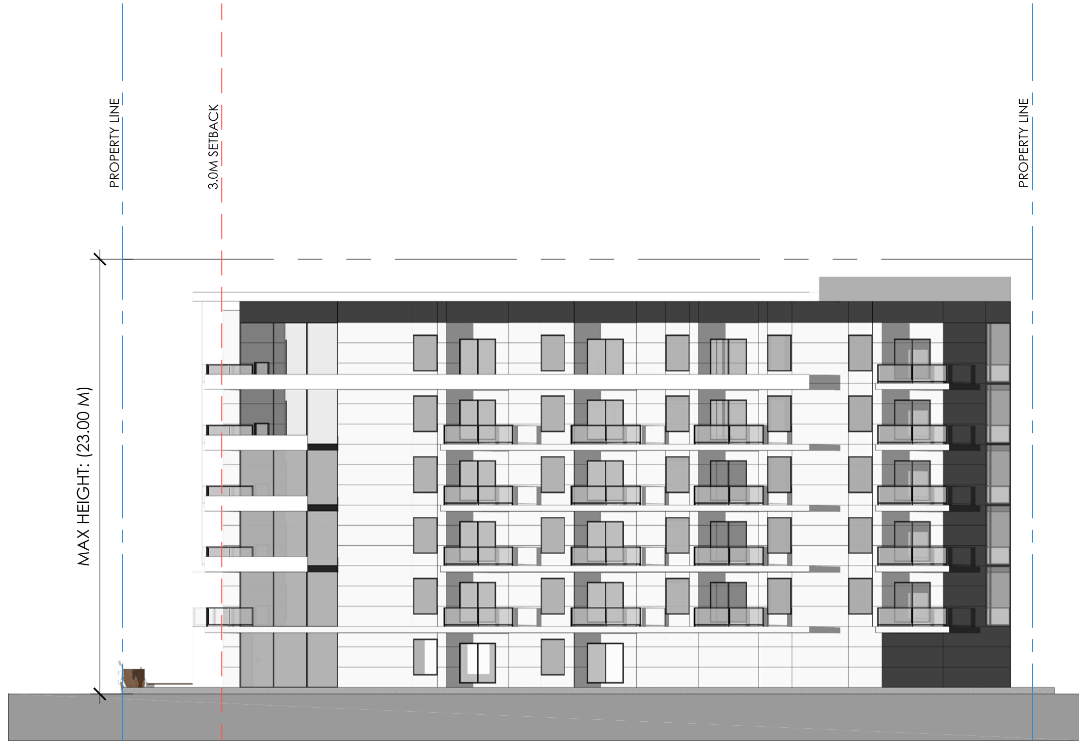
APPENDIX 2 - NORTH ELEVATION