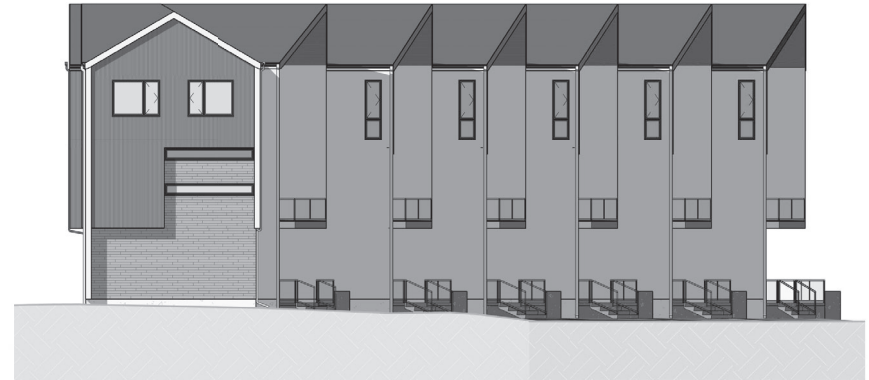
③ South Building North Elevation 1/16" = 1'-0"