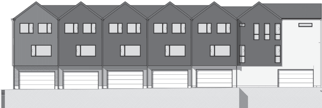
② South Building East Elevation 1/16" = 1'-0"