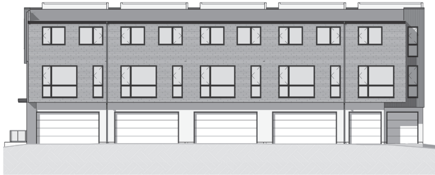
② North Building East Elevation 1/16" = 1'-0"