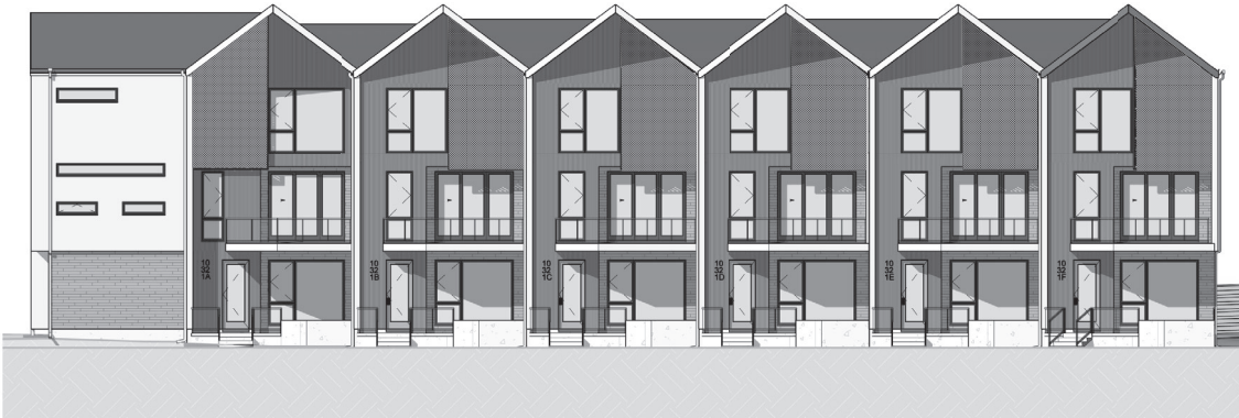
① South Building West Elevation 1/16" = 1'-0"