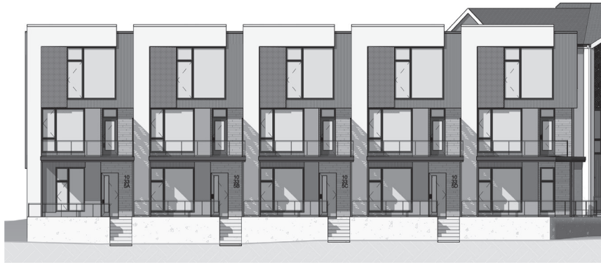
① North Building West Elevation 1/16" = 1'-0"