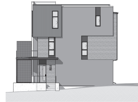
④ North Building South Elevation 1/16" = 1'-0"

CANTIRO - Groat Estates North Building Elevations 10335-10321 Wadhurst RD NW Edmonton AB Design Development - 2021 11 15