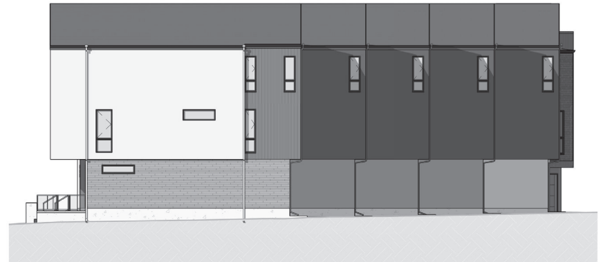
④ South Building South Elevation 1/16" = 1'-0"

CANTIRO - Groat Estates South Building Elevations 10335-10321 Wadhurst RD NW Edmonton AB Design Development - 2021 11 15