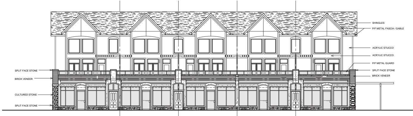
SOUTH Elevation (95 Avenue View) AREA 'A'