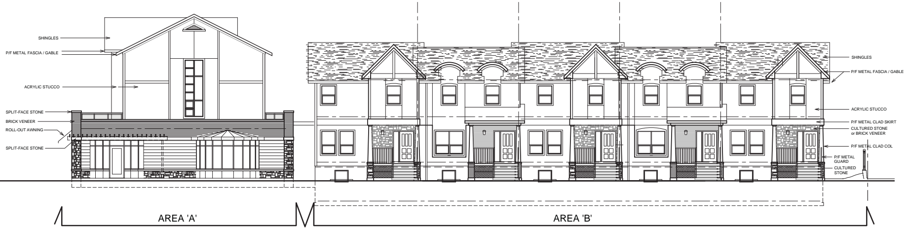
EAST Elevation (153 Street View)