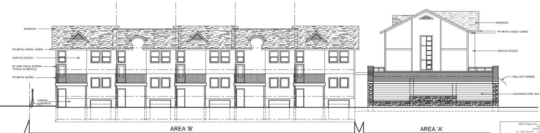
WEST Elevation (Lane View)

ABS Origins Inc., Architectural - Engineering Technologies 200, 17404 - 105 Avenue EDMONTON, ALBERTA T5S 1G4 Tel: (780) 454-0378 Fax: (780) 453-0026 email: info@absorigins.ca