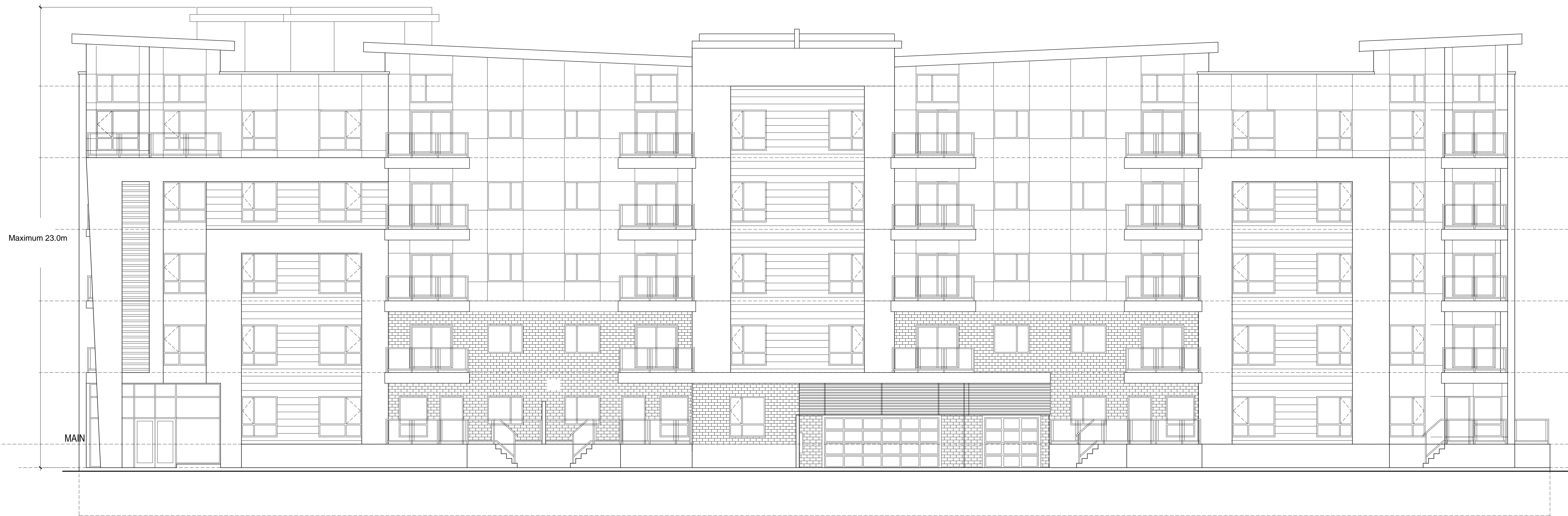
APPENDIX-2 NORTH ELEVATION