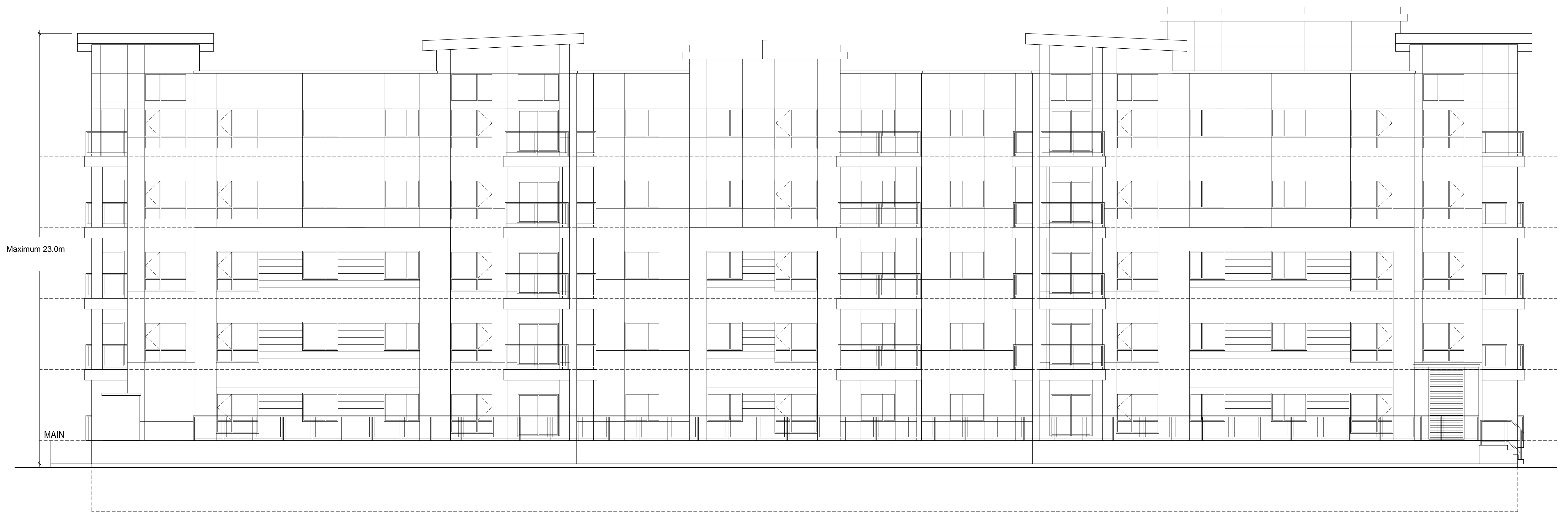
APPENDIX-3 SOUTH ELEVATION