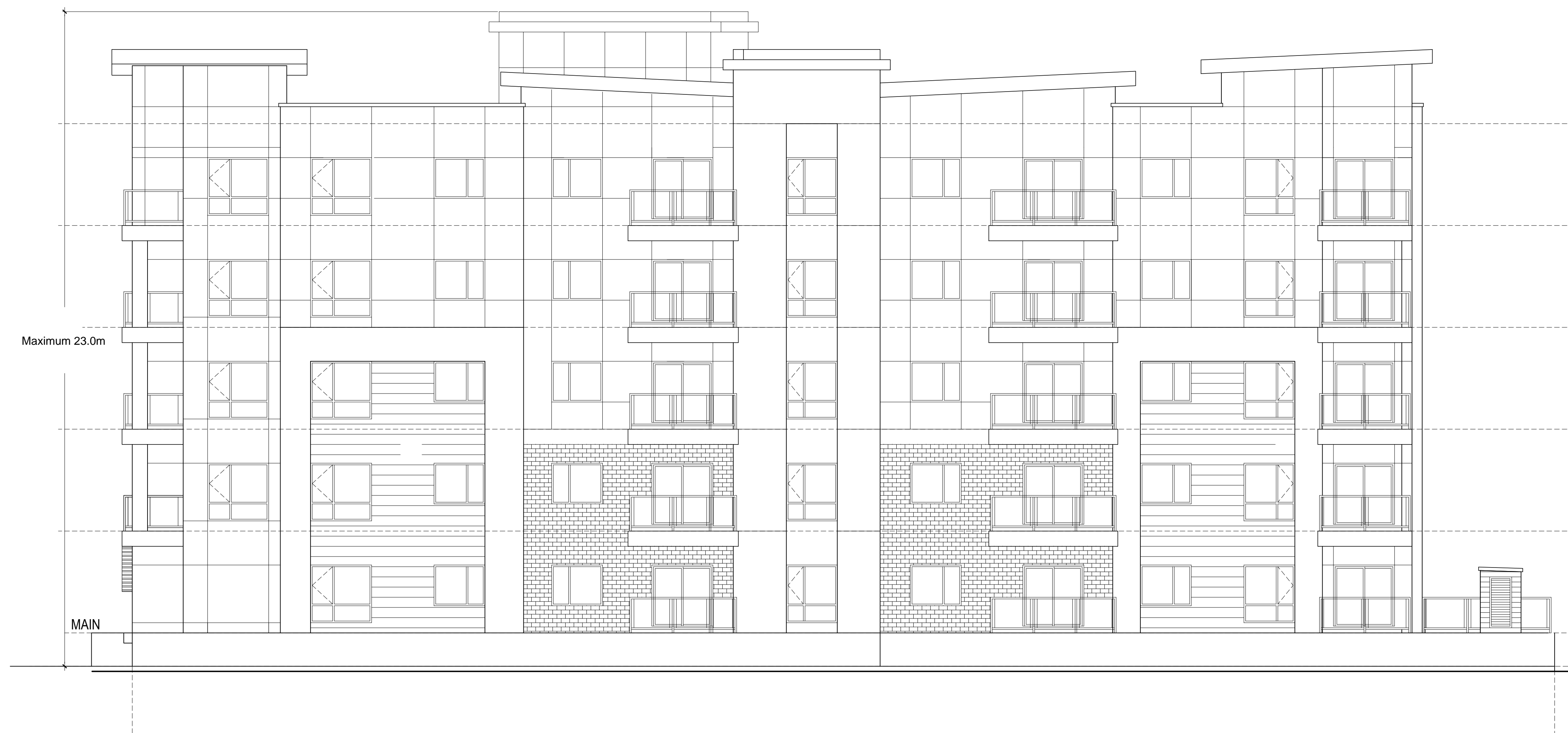
APPENDIX-4 WEST ELEVATION