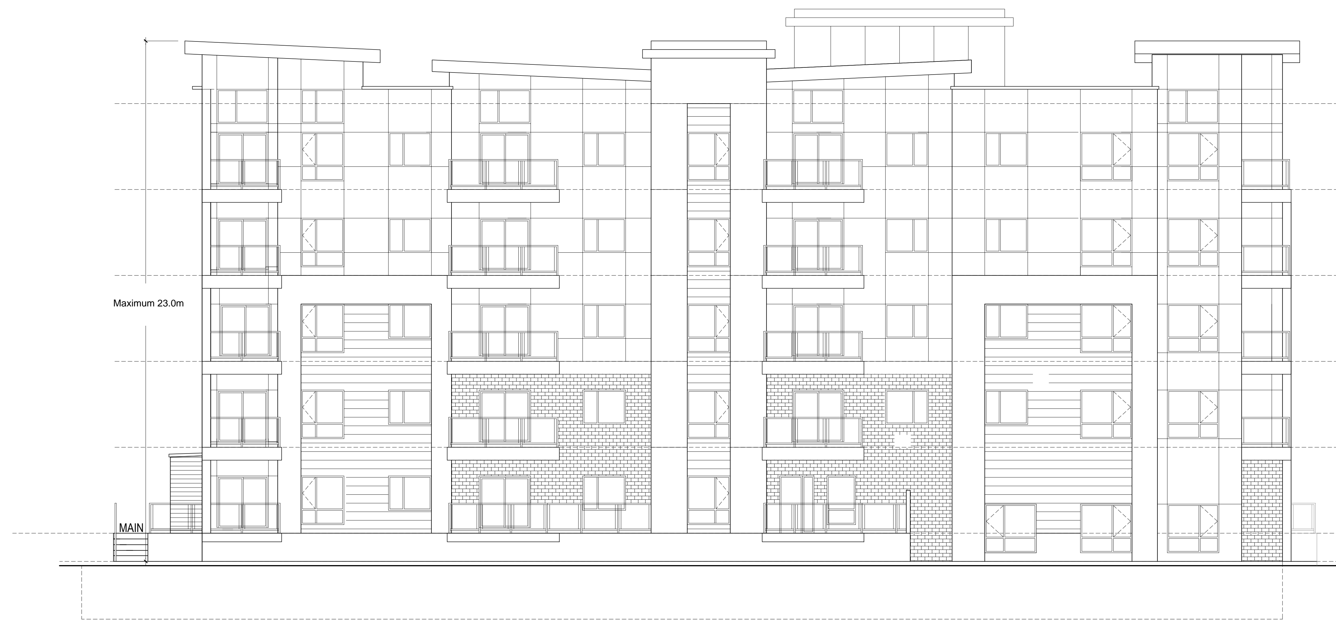
APPENDIX-5 EAST ELEVATION