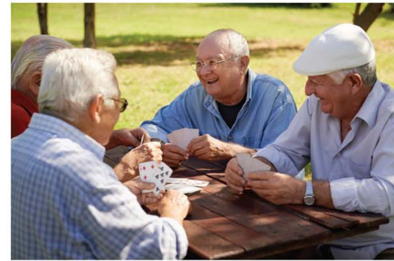
SENIORS' PARK ③