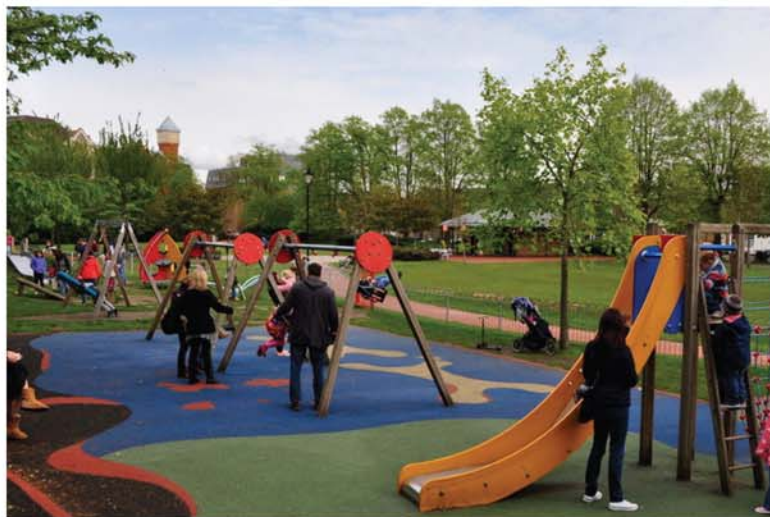
CHILDRENS' PARK ④