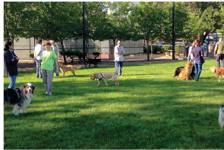
PETS' PARK ②