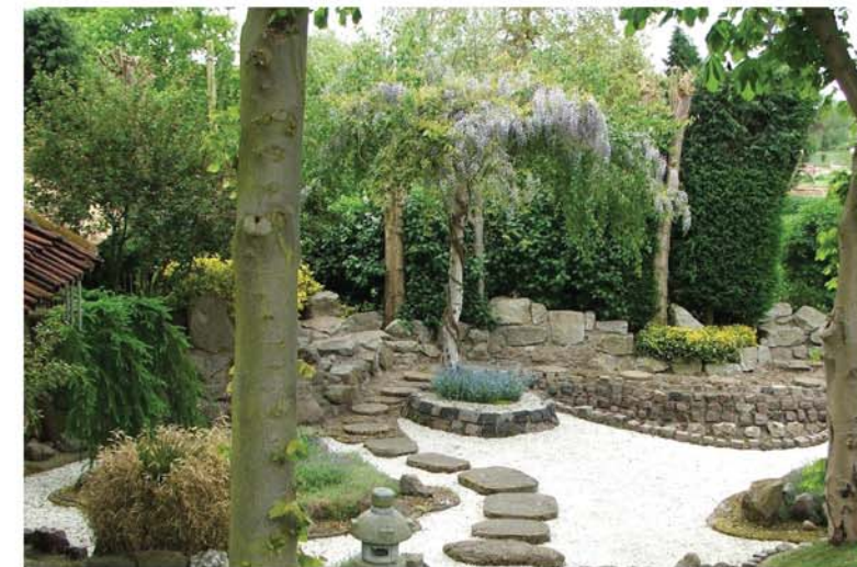
ZEN GARDEN ⑥