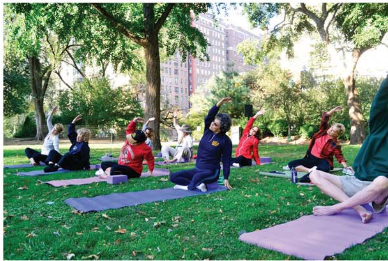
YOGA & WELLNESS PARK ①